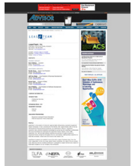
Employer Profile Page